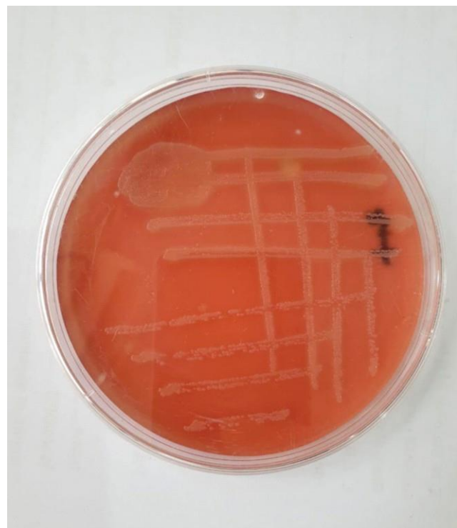
Fig 4: Staphylococcus growth on blood agar