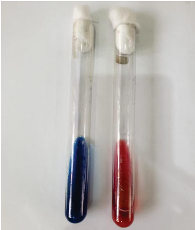
Fig 2: Pseudomonas Aeruginosa-Citrate positive: TSI agar red butt and red slant and no gas