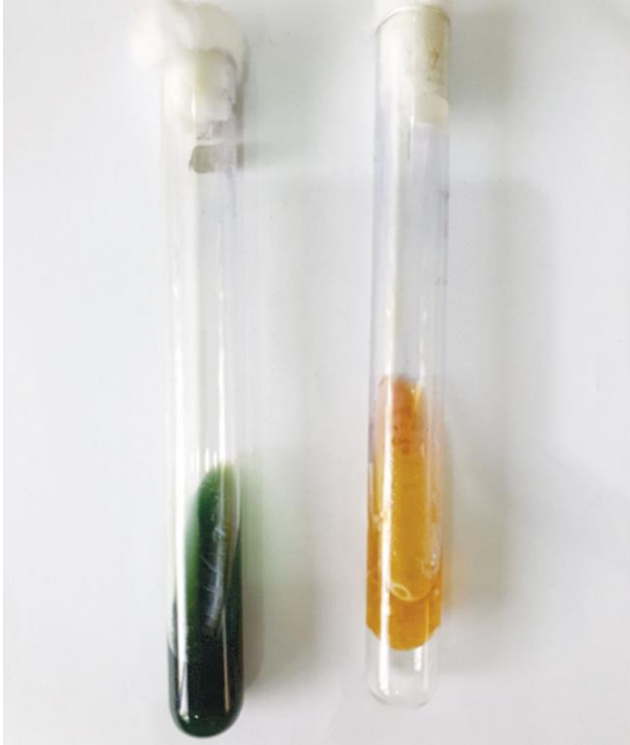
Fig 1: E. coli Citrate negative: TSI agar showing yellow butt and yellow slant with gas