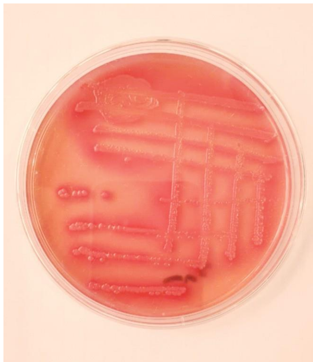
Fig 5: Growth of E Coli on MacConkey agar